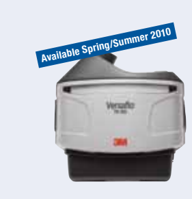
3M™ Versaflo™ TR-300 Powered Air Turbo